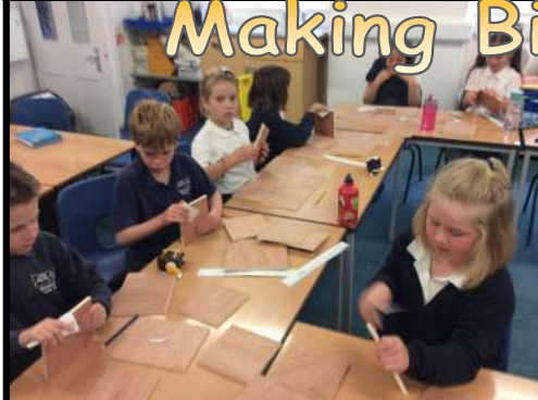
Making Bird Houses