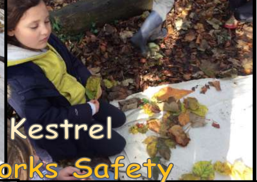
Merlin & Kestrel PHSE Fireworks Safety