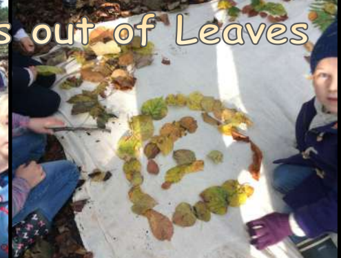
Making Fireworks out of Leaves