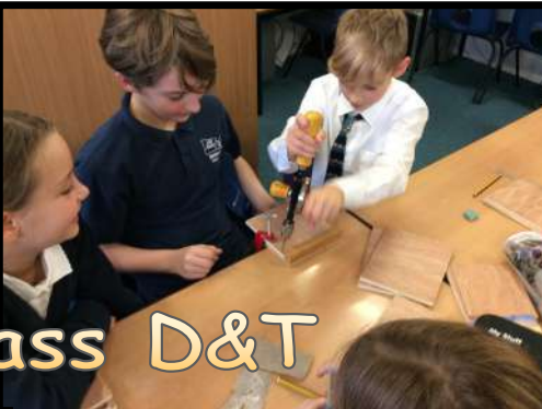
Eagle Class D&T